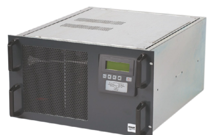
KOHLER MINIPowerPLUS rack mounted