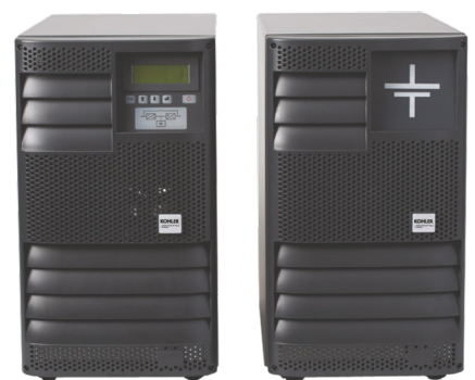
KOHLER MINIPowerPLUS Tower

Battery autonomy is similarly flexible, and can be customised using battery kits. These can be standalone or integrated with the UPS power boards. Full-load battery standby time of up to eight hours is available with a rapid recharge capability. Battery redundancy can also be built-in for guaranteed continuity of supply.