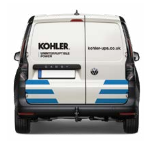
Exceptional 24/7/365 Service Support